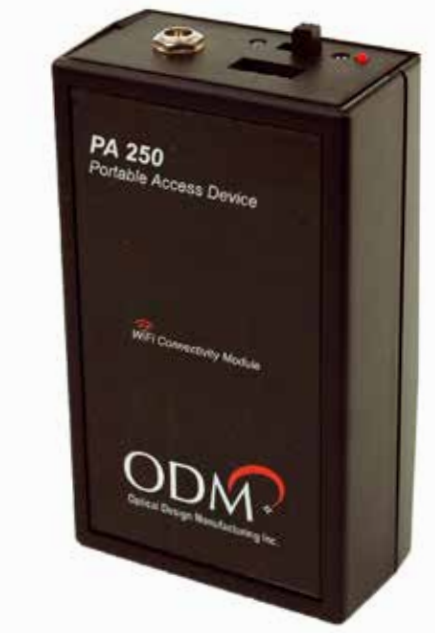
InSpec<sup>™</sup> for Windows included. App for Android & Apple devices available online.